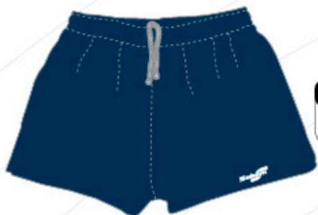
Microfibre Microfibre training shorts in 4 different colours.