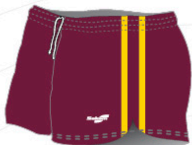
Running Shorts Custom running shorts with a sportsmesh inner brief.

Multi Function Shorts - Sekem offers a wide range of shorts for training, running & stepping out as a team. Give your team that professional look everywhere it goes.