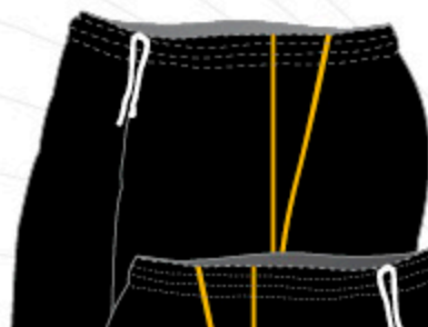
Long Casual Custom designed casual shorts in microfibre or sublimated.